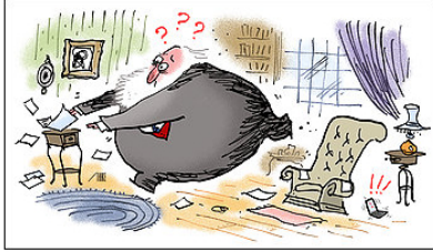
(Bob Staake for The Washington Post)

Turns out cleanliness isn't really next to godliness, it's next to cleanly. At least it is in my dictionary. (Russell Beland)